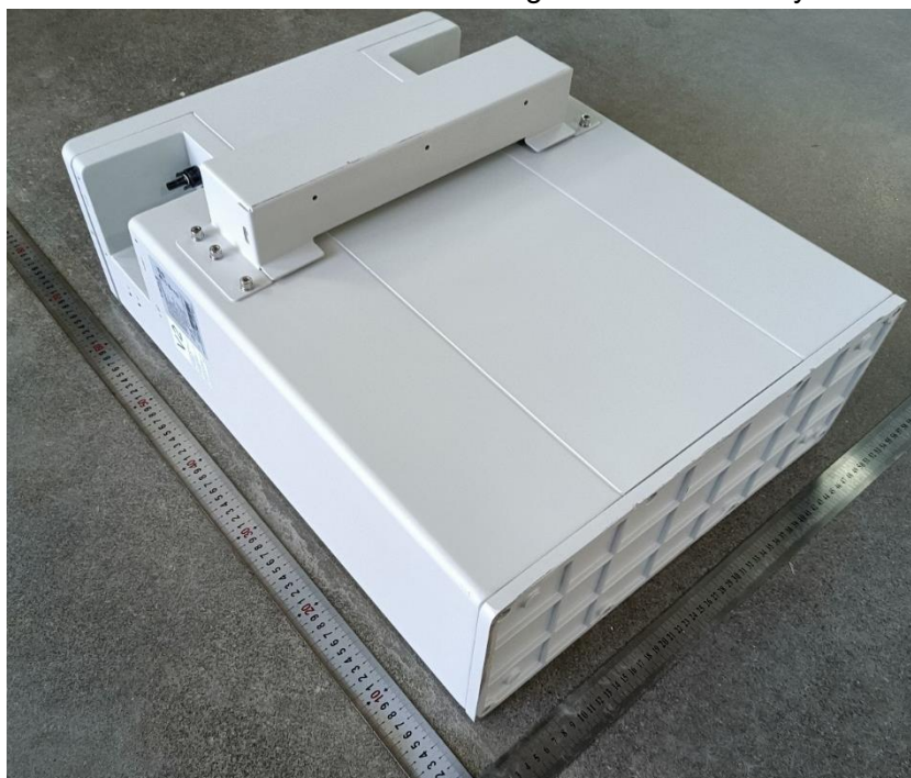
图 2 可充电锂离子电池背面 Picture 2 Back view of Rechargeable Li-ion Battery