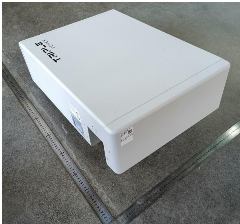
图 1 可充电锂离子电池侧面 Picture 1 Side view of Rechargeable Li-ion Battery